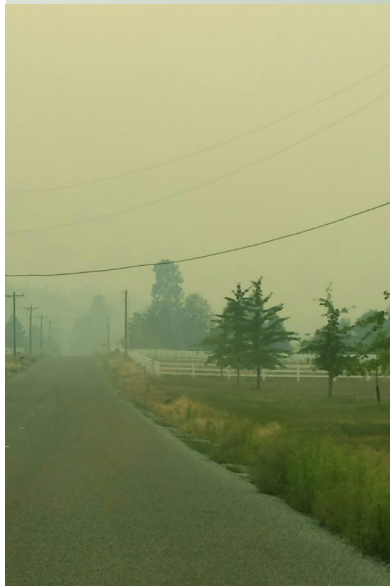
The view of my property of the smoke from all the fires

I have decided to thin down the flock more again this year and will only be working on solid color large fowl. This includes black, buff, chocolate, lavender, and white. I will continue to raise all the bantams I currently have which includes black, blue, lavender and the wheaten/blue wheaten varieties. I have several bantam blue wheaten cockerels and a few splash wheaten cockerels that will be available in a couple months.