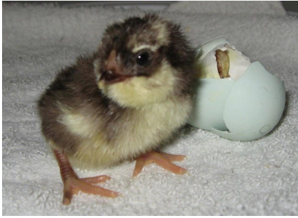
Bantam Chocolate Chick

I have been breeding project chocolate birds since the spring of 2011. I started with my bantam project first and used a bantam black ameraucana cockerel over bantam chocolate orpingtons.