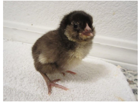
Large Fowl Chocolate Chick

This gene is not the same chocolate that some people say their polish display. Polish are dun/khaki. The variety breeds true. The gene modifies the black in the beaks, toe nails and legs to be chocolate in color.