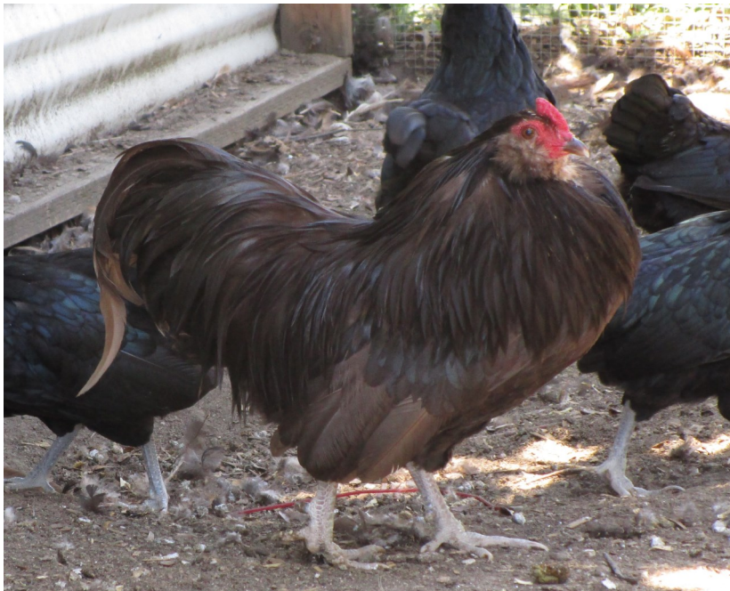
Bantam Chocolate male

I was not able to send out any LF project chicks or eggs this year due to the poor laying ability. It is something I will continue to work on. I have been able to send out many bantam chocolate hatching egg orders and am waiting for the girls to start back up so I can get more people working on them.